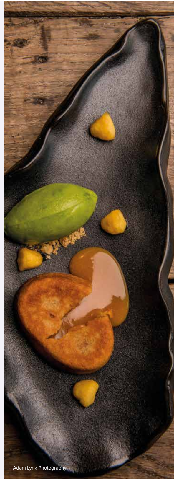
Adam Lynk Photography