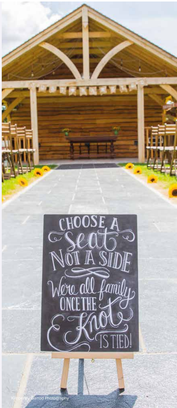
Kimberley Garrod Photography

We provide a flexible approach to the planning and coordination of your day and will work with you to achieve the day you truly want. View our packages on the opposite page and see what we can offer.